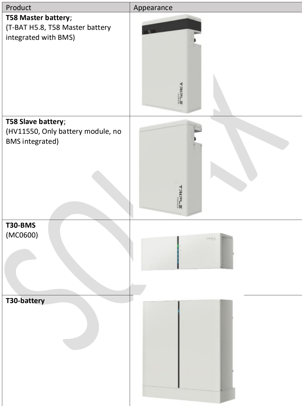
Table 1: Product and Appearance